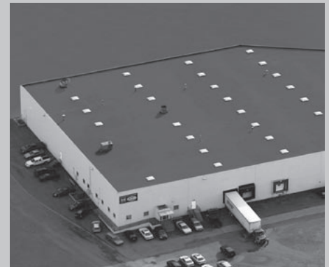
Hörmann Flexon LLC, Leetsdale, PA

For assistance and service call 1 877 OK HORMANN (1-877-654-6762)