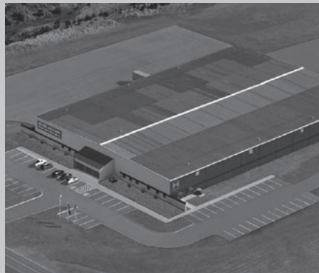
Hörmann LLC, Vonore, TN