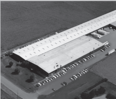
Hörmann LLC, Montgomery, IL

whether traditional or contemporary, we have the door you're looking for. Each Hörmann door gives you the perfect array of benefits and options, with the drive to match.